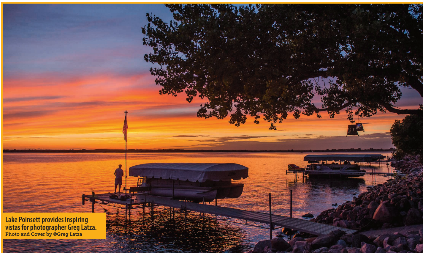
Lake Poinsett provides inspiring vistas for photographer Greg Latza.

“Even with the challenges, the real growth we have is along the reservoir,” said Keller.