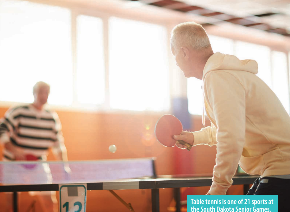
Table tennis is one of 21 sports at the South Dakota Senior Games.