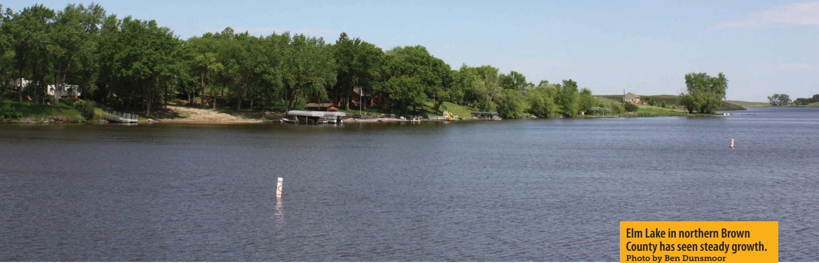
Elm Lake in northern Brown County has seen steady growth.