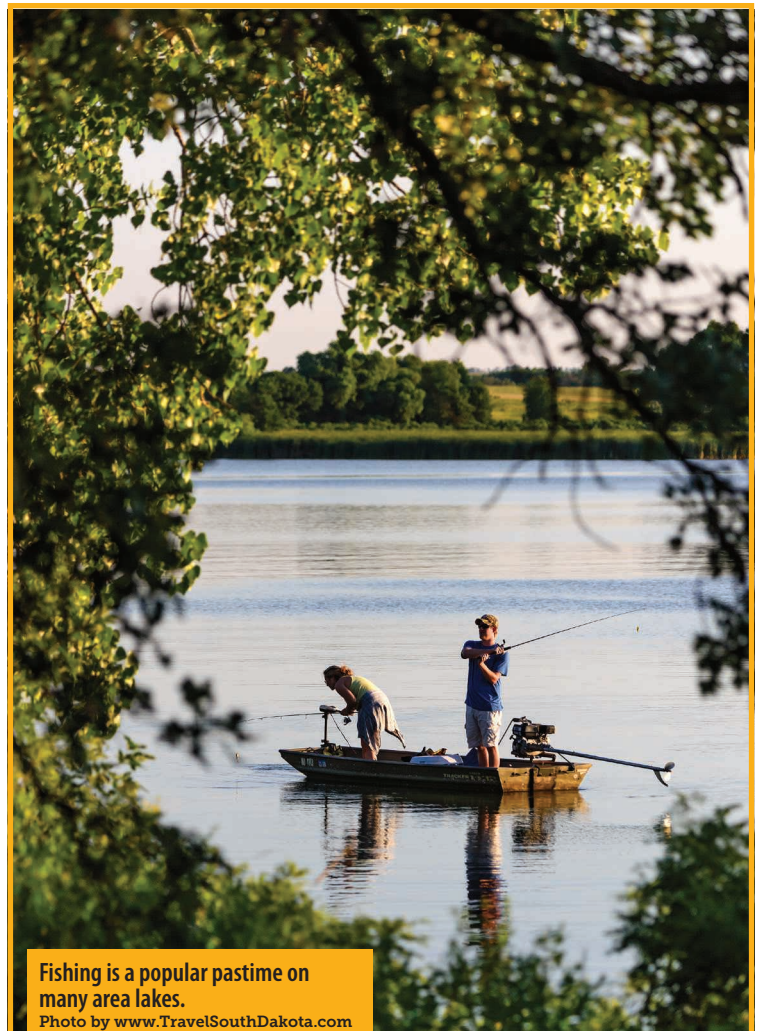
Fishing is a popular pastime on many area lakes.