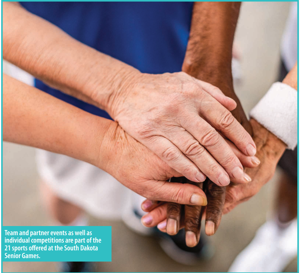
Team and partner events as well as individual competitions are part of the 21 sports offered at the South Dakota Senior Games.

By 1996, state funding for the games was withdrawn, but the games continued on. A Senior Games board of directors was formed, comprised of participants from across the state. The non-profit establishes the rules and regulations for the games and provides financing and developing local, regional games as well as the state games which features 21 different sports.