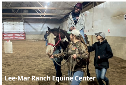
Lee-Mar Ranch Equine Center