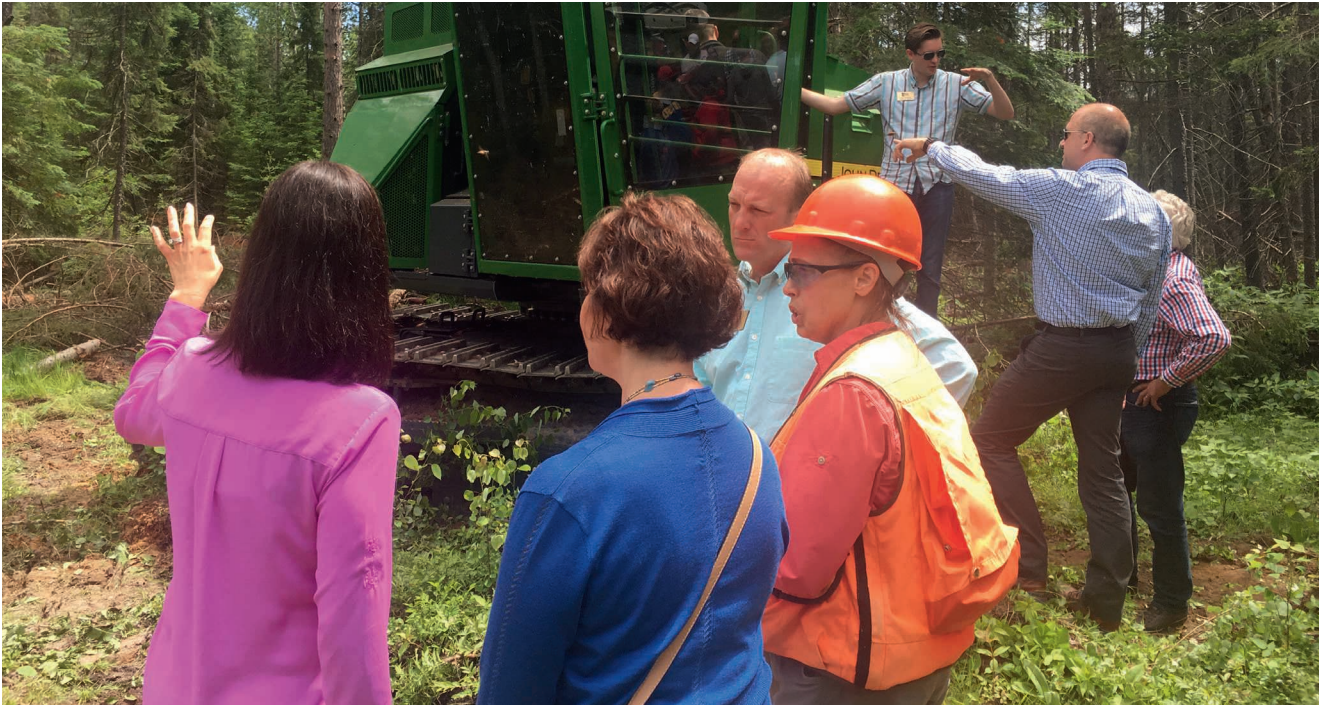
Leadership students take a field tour of a logging operation in northern Minnesota.