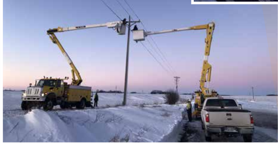
Renville-Sibley and Redwood Electric linemen work together to repair a broken cross arm.

multiple outages. Our members were out of power a total of 5,667 hours.