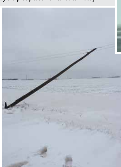
A total of 14 poles were broken during the April storm.

The line crews started reporting broken poles and downed wires. A crew was sent to the