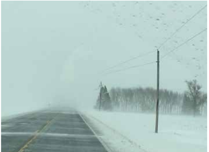
Winds blow the power lines causing the lines to gallop.

We knew from the previous night that 3-mainline 3-phase poles were broken on the major tie line between Cairo and Birch Cooley Substations. This is the mainline for a contingency to