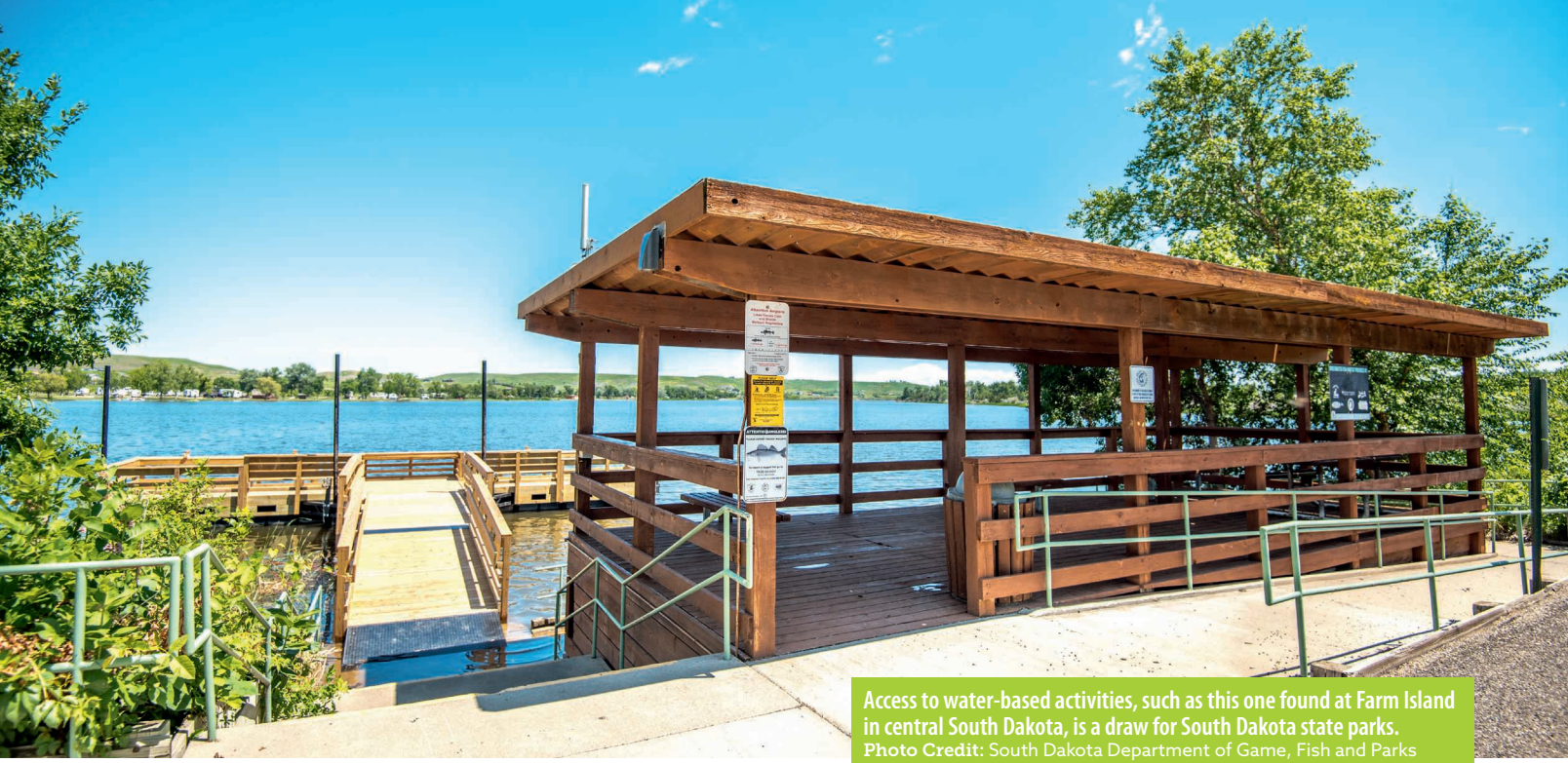
Access to water-based activities, such as this one found at Farm Island in central South Dakota, is a draw for South Dakota state parks.

114-mile Mickelson Trail, South Dakota's Snowmobile Trail Program, and maintains 240 public water access areas.