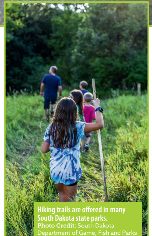
Hiking trails are offered in many South Dakota state parks.

The South Dakota State Park system includes 13 state parks, 43 recreation areas, five nature areas, one historic prairie, 69 lakeside use areas and 10 marina/resorts. In addition, the Division of Parks and Recreation manages the