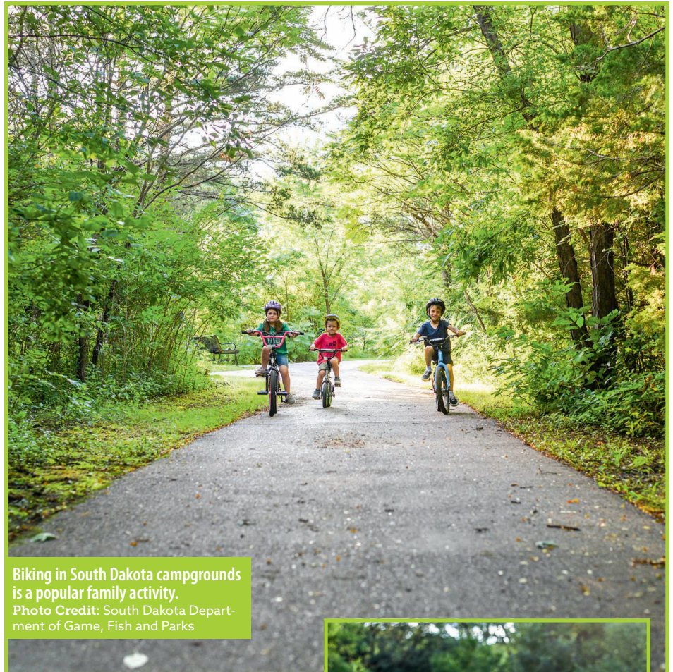
Biking in South Dakota campgrounds is a popular family activity.

And as Americans head outdoors celebrating June as both National Camping Month and Nation Great Outdoors Month, thousands of South Dakotans will